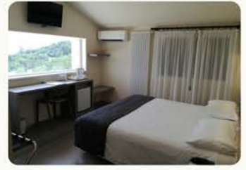
Junior Suite - Family Room