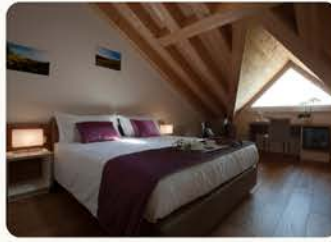
Panoramic Standard Room